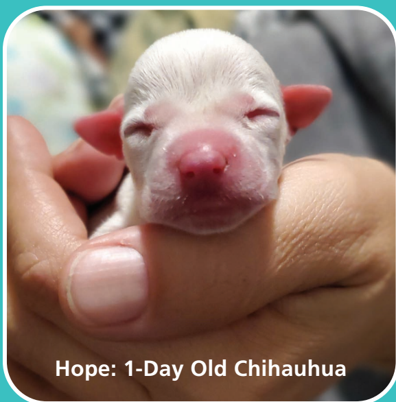
Hope: 1-Day Old Chihuahua