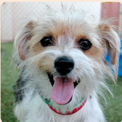
Clue was one of the dogs saved by your support of HALO and Fix.Adopt.Save. Your gifts helped give him medical care that cured him of an awful cough.

This was the result of a four year campaign called Fix.Adopt.Save. The campaign is a collaboration between major funders, animal welfare groups (including HALO), and the community. The campaign set small goals for each animal welfare group that worked in tandem to reach bigger goals.