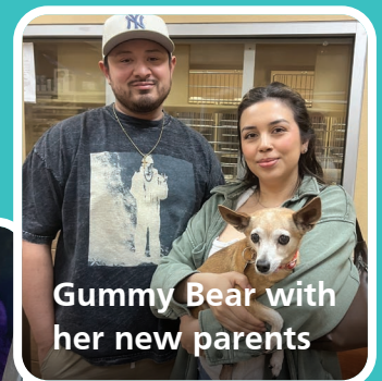
Gummy Bear with her new parents