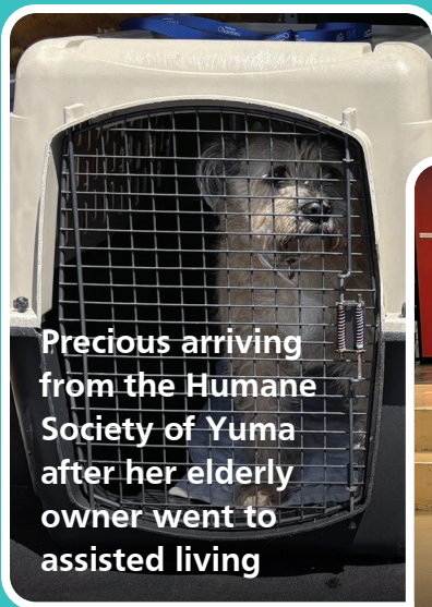
Precious arriving from the Humane Society of Yuma after her elderly owner went to assisted living

overwhelming volume of pets coming into their doors. This allows all of us to save more lives. HALO is able to provide individualized care to these pets, ensuring they get all the medical care and TLC they need to be ready for their new families. Your support means you're right here with us, saving lives!